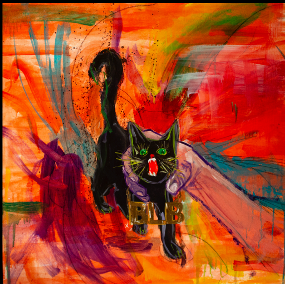
SOMETHING'S AT MY NECK