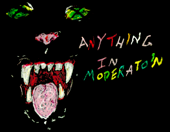
ANYTHING IN MODERATION